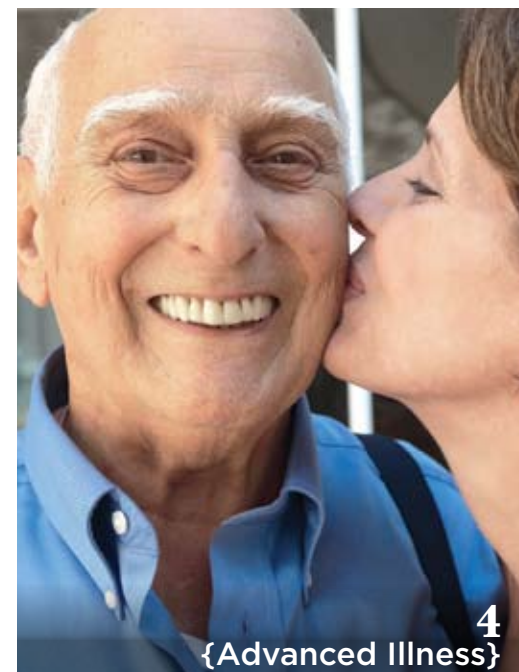
4 {Advanced Illness}