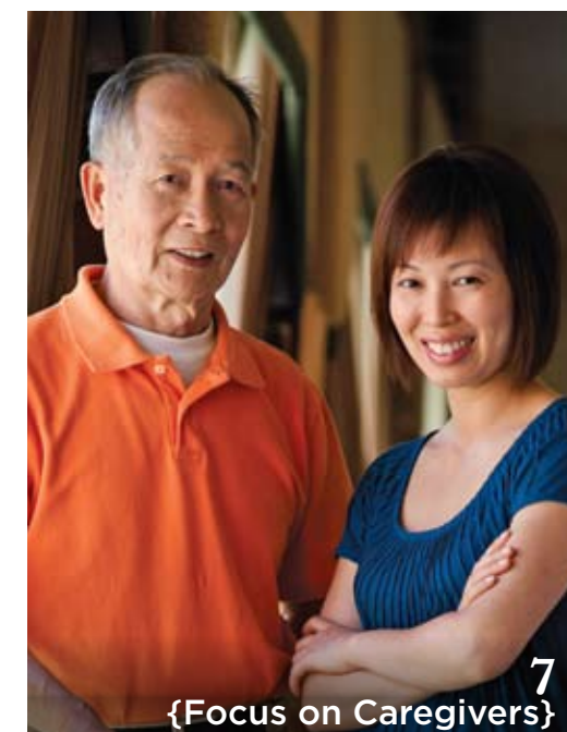
7 {Focus on Caregivers}