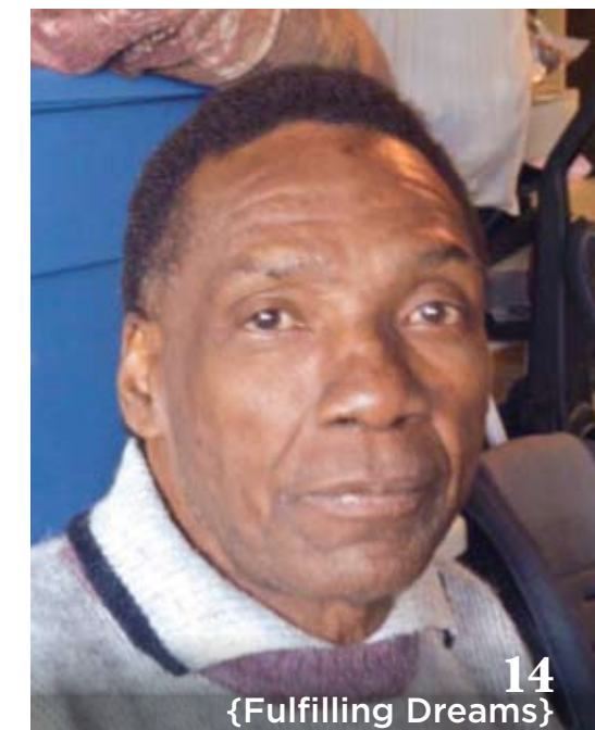
14 {Fulfilling Dreams}

4 Advanced Illness: Extending the continuum of care.